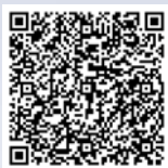
Vitamin C Serum C Vitamin Serum